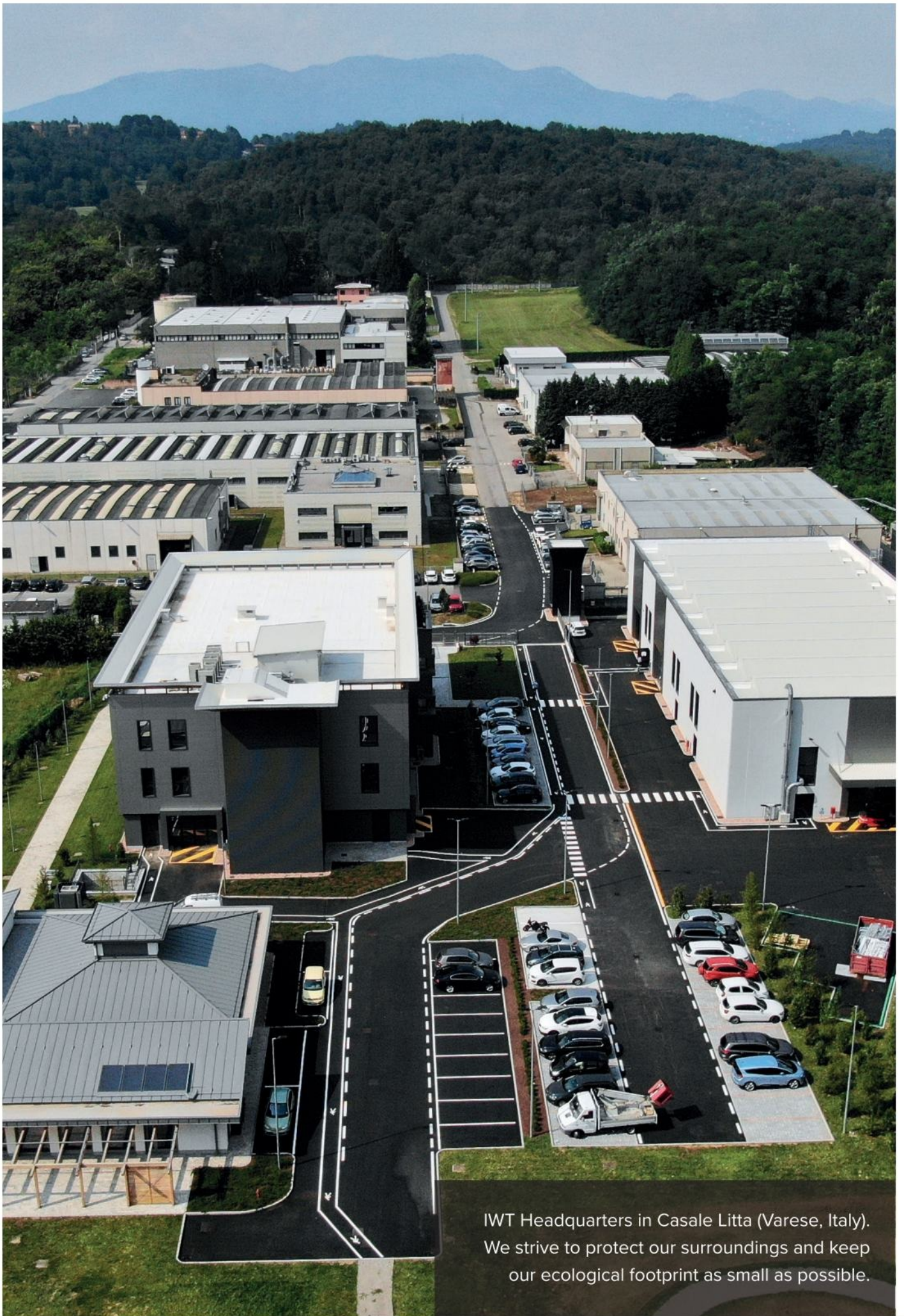
IWT Headquarters in Casale Litta (Varese, Italy). We strive to protect our surroundings and keep our ecological footprint as small as possible.